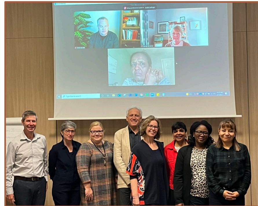
Photo from ISDC retreat in March 2022, which focused on the workplan