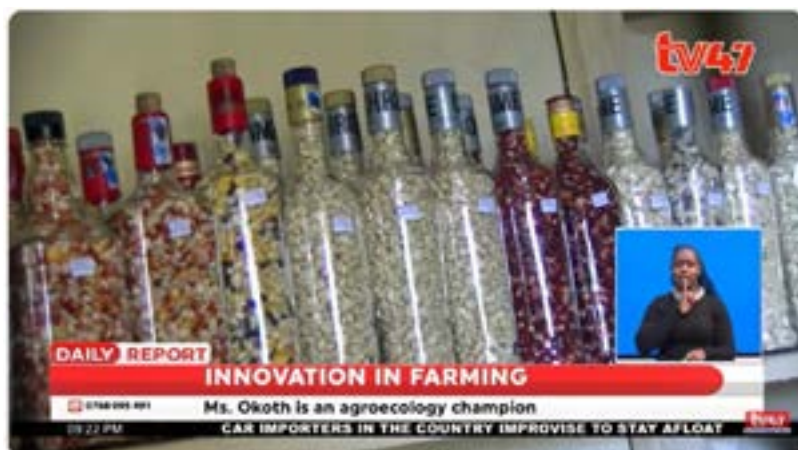
Farmers in Nyanza have embraced Agroecology

https://www.youtube.com/watch?v=cxuHmbGF8gg