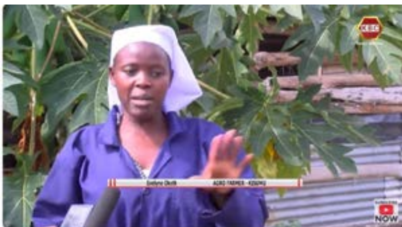
Farmers urged to practice Agro-ecology farming

https://youtu.be/soN1WPKdeLY?si=vpSVk-LwE0dzSZHY