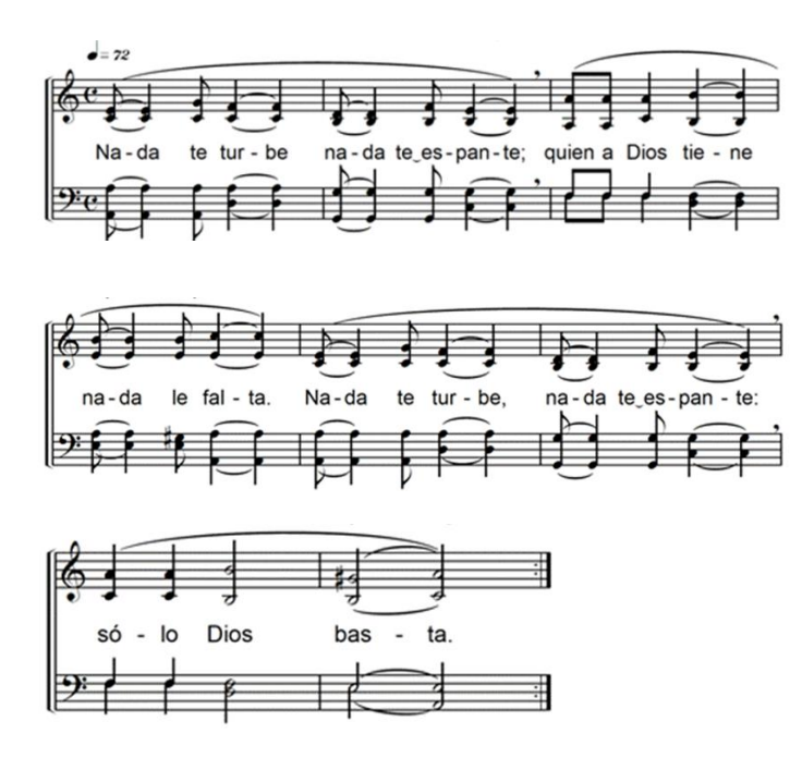
Nothing can trouble, nothing can frighten. Those who seek God shall never go wanting. God alone fills us.

Nada te turbe, nada te espante; quien a Dios tiene nada le falta. Nada te turbe, nada te espante: sólo Dios basta