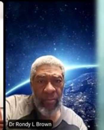
Spiritual Leadership Institute Gen Z Book Study