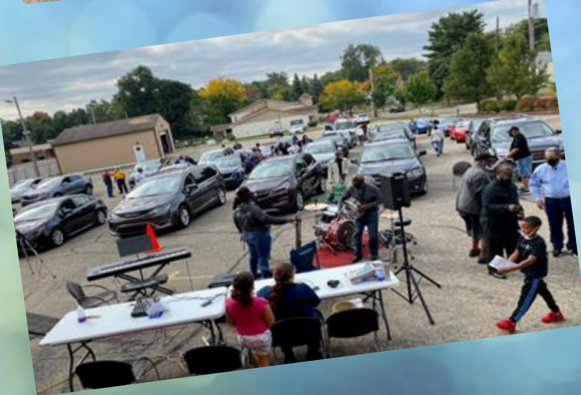
Parking Lot Vital Worship Experience