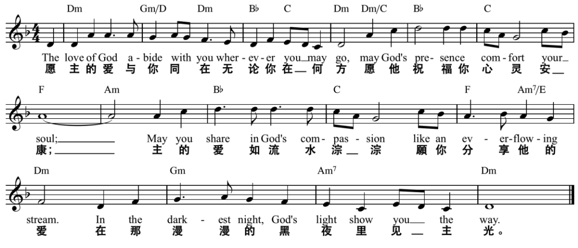
©© 2009, Asian Planning Group. All rights reserved.