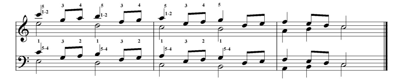
Thumb Glissando – a "worming" moment!