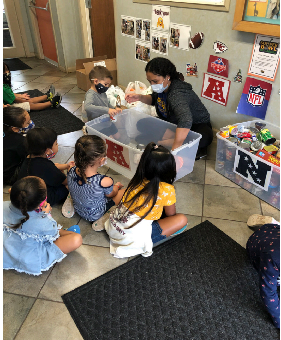
The older students even got a math lesson while learning about sharing and caring for all God's children!