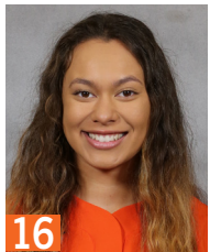
16 ALIA LOGOLEO *So. - OF/INF