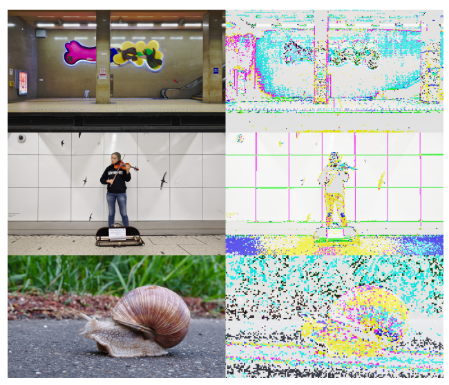
Figure 2. Segmentation of three test images [1]: each distinct color represents one of 64 CDF tables used to encode a latent spatial location ( 16 \times 16 pixels patch)

entropy coder bitcount. The CDF table index is determined for each spatial location by evaluating each CDF table in inference. This can be done in a vectorized operation given sufficient memory. During training the CPM is evaluated instead of CDF tables such that the probabilities are up to date and the model is differentiable, and the bit cost is returned as it contributes to the loss function. The cost of CDF table indices has been shown to be neglectable due to the reasonably small number of priors, which in turns results from the fact that little gain in latent code entropy has been obtained by increasing the number of priors.