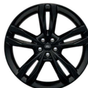
21" Premium Gloss Black-Painted Aluminum Optional; Included with ST Performance Brake Package