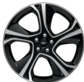
20" Bright-Machined Aluminum with High-Gloss Black-Painted Pockets Standard on ST