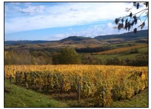
Terroirs du JURA