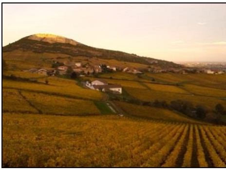
Terroirs de BOURGOGNE