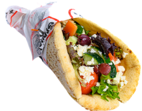
Arcadian Chicken Pita