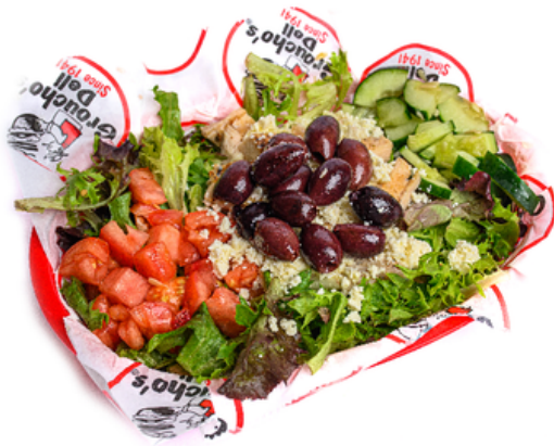
Arcadian Chicken Salad