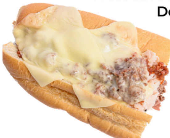
STP DIPPER ®

is proud to be South Carolina's Most Loved, Historic, & Awarded Deli since 1941