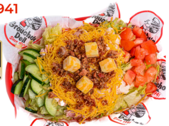
MY WIFE'S SALAD BOWL ®