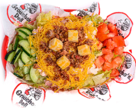
My Wife's Salad