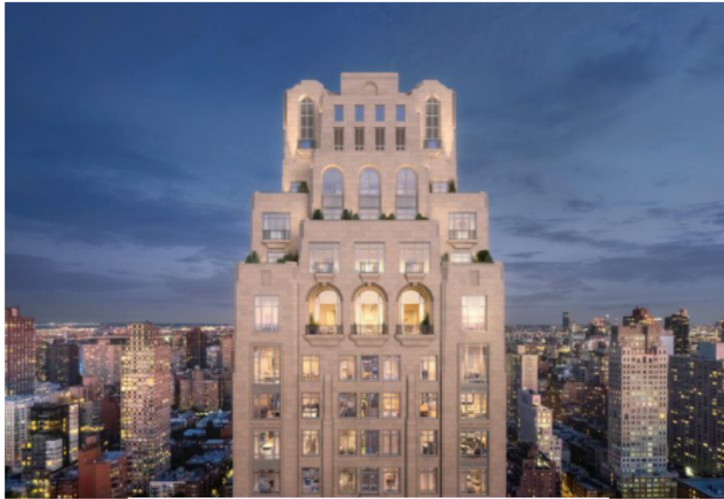
Crown of 200 East 83rd Street (Rendering Credit: DBOX)