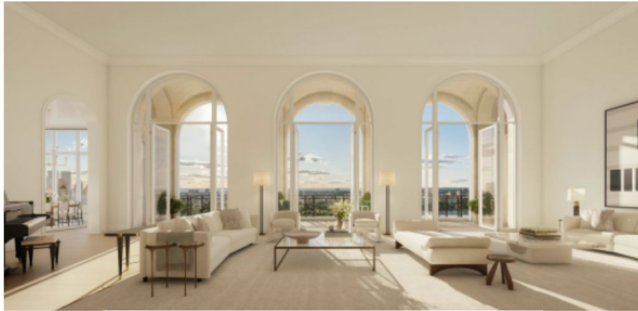
Penthouse great room at 200 East 83rd Street by Robert A.M. Stern Architects

Upper East Side | Condo | Two to Five-Bedroom Homes