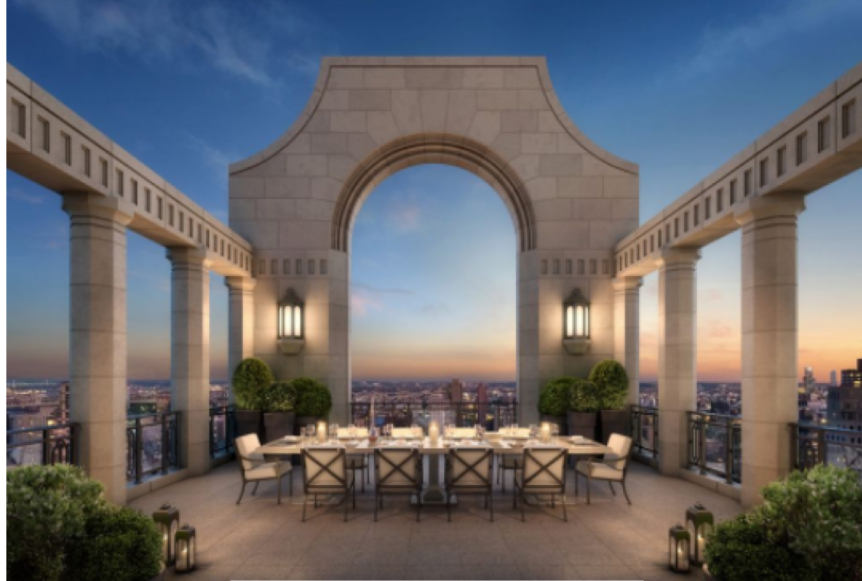
Penthouse terrace at 200 East 83rd Street (DBOX)

Often times the use of arches is reserved for the most spectacular units of a building. At 200 East 83rd Street , a newly-launched condo designed by Robert A.M. Stern and Rottet Studio, its collection of crowning penthouses feature double-height arched spaces to create, in their words, "A gracious and sublime living experience." Buyers have gravitated to the superior craftsmanship of the building and the sales team reports that 30% of its 86 residences are already in-contract, prior to the official sales launch last week.