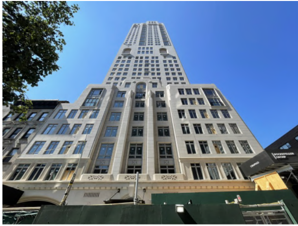
200 East 83rd Street.