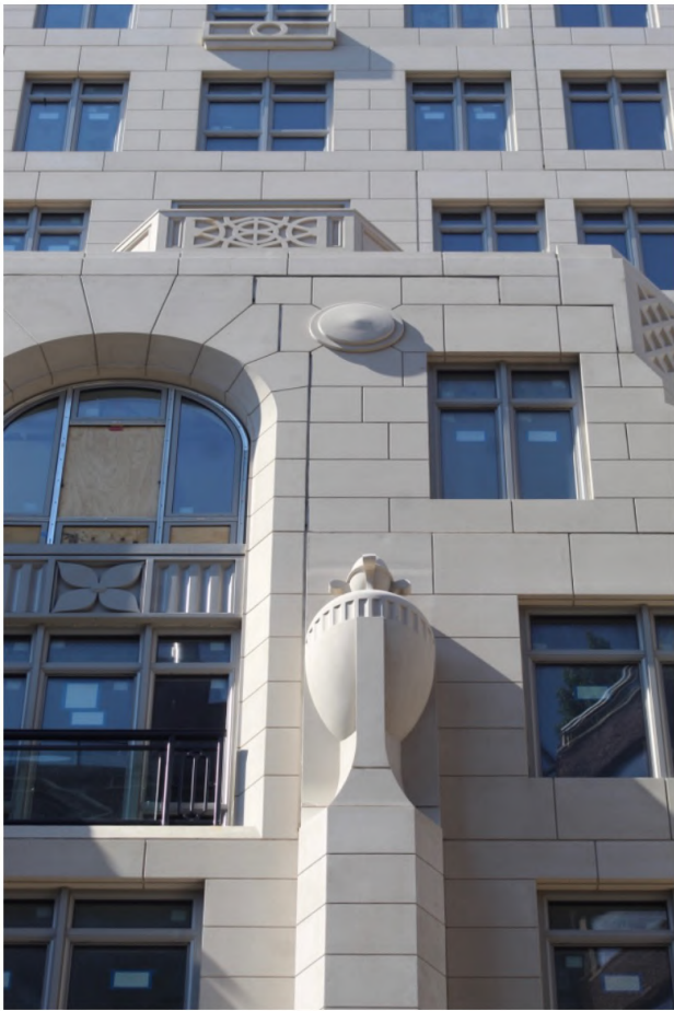
200 East 83rd Street.