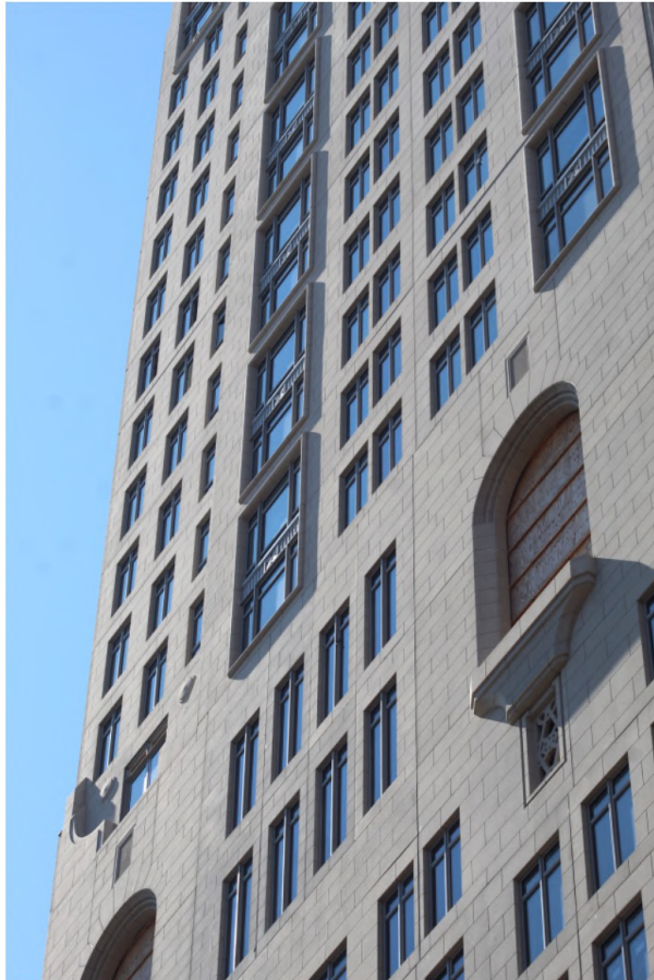
200 East 83rd Street.

The following close-up shots detail the craftsmanship in the exterior with its stone motifs and combination of sharp and curving forms.