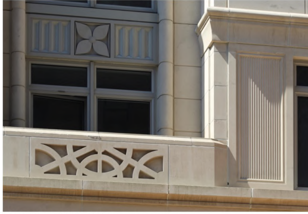
200 East 83rd Street.

Homes come in one- to six-bedroom layouts and are priced from $2.05 million to $32 million. Prices for two-bedrooms start at $3.175 million, three-bedrooms at $4.35 million, and four-bedrooms at $5.35 million. There are also three exclusive penthouses available in five- or six-bedroom layouts with prices varying from $23 million to $32 million. Each of these comes with its own private outdoor space.