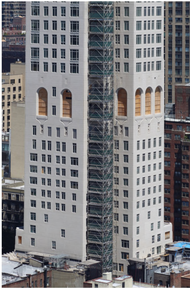
200 East 83rd Street.

The following close-up shots detail the craftsmanship in the exterior with its stone motifs and combination of sharp and curving forms.