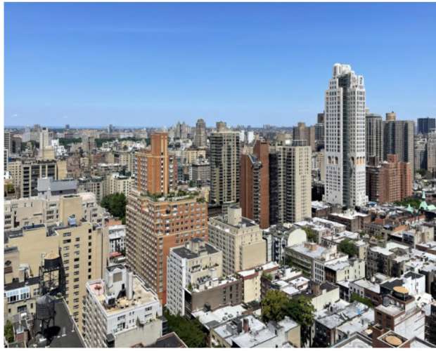
200 East 83rd Street.