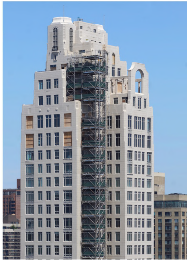
200 East 83rd Street.