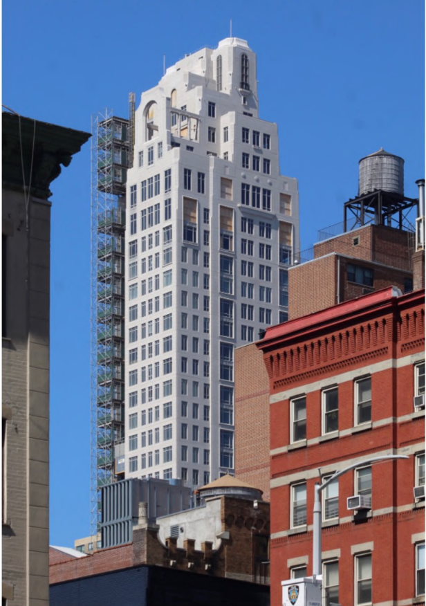
200 East 83rd Street.