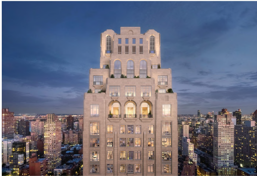
200 East 83rd Street. Rendering by DBOX.

BY: MICHAEL YOUNG AND MATT PRUZNICK 8:00 AM ON JULY 26, 2022