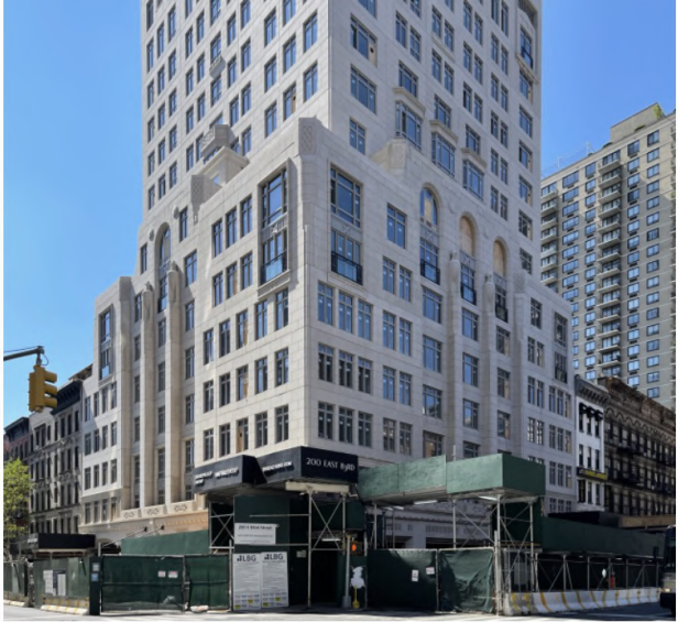
200 East 83rd Street.