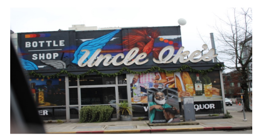
Uncle Ikes 0% black owned

The attempt to convey ownership diversity through external imagery is emblematic of a more profound issues and marginalization. Black and Brown communities, once actively engaged in the cannabis industry, are now confronted with a facade that seeks to mask the true ownership structures at play. The consequence is not merely a loss of economic opportunities but