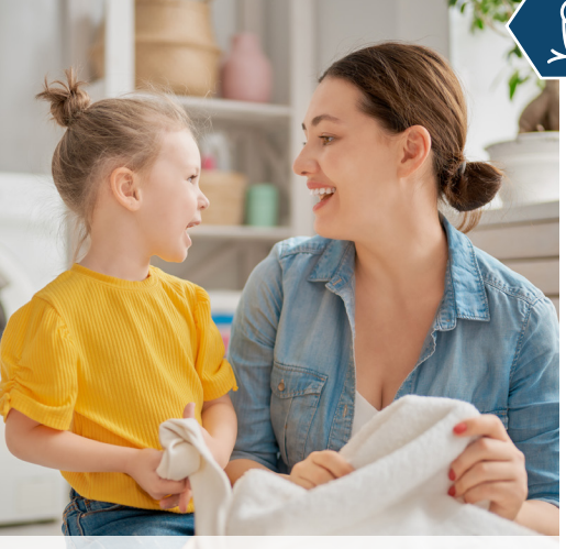
Lists of age appropriate chores and responsibilities can be found on many helpful websites.

What if your kids don't want to do chores? Give them a number of choices and let them decide which ones to take on. They'll be more likely to help out without complaining.