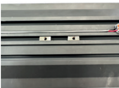
Screws line up with internal bolts.

Feet are attached to the base with 2 countersunk screws.