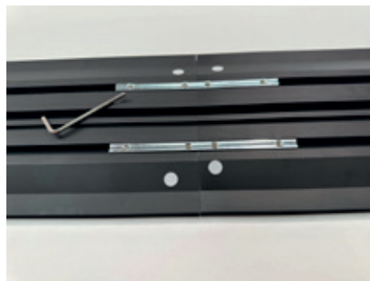
Slide into corresponding section so insertion is equal. Tighten grubs screw.