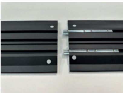
Loosen grub screws and slide out joining bars.

All straight joins are colour coded white.