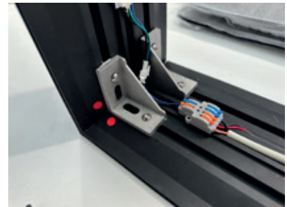
Attach upright, tighten & connect power plugs.