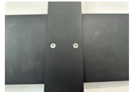
Using allen key insert the 2 screws though the feet into the base.