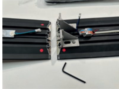
Drop in corner connector blocks