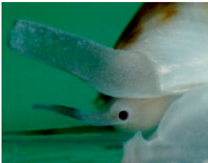
Juvenile Tonna perdix

Following are a few of the groups (Families of mollusks) covered: