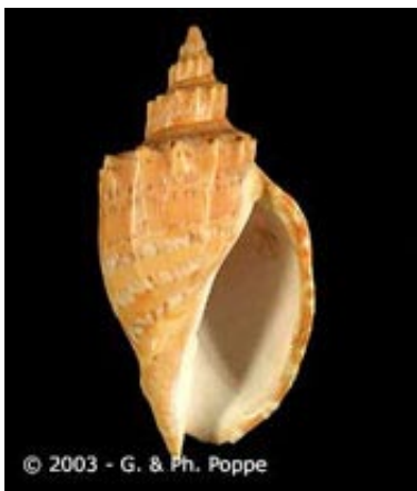
VOLUTIDAE - Lyria ponsonbyi

Specimens were exchanged and purchased to fill in the missing gaps. Deep water shells were acquired from trawler men and dredgers.