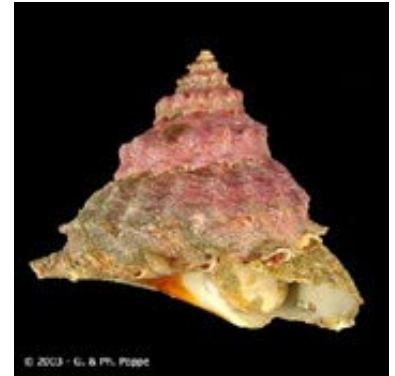
TURBINIDAE Bolma andersoni