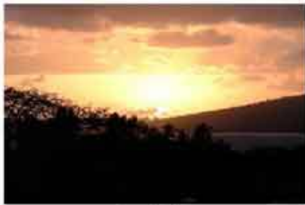
Thousand Yard View Sunset