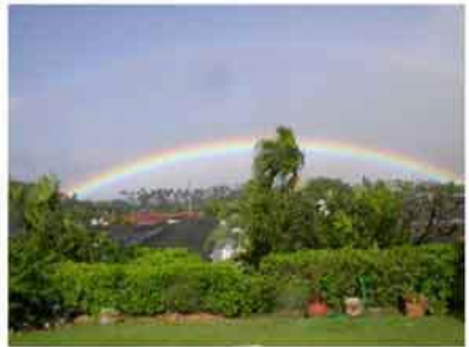
Thorsson Yard View Morning Rainbow

During 2003, I suggested that it might be a good idea to produce a CD set containing HSN issues from January 1960 to December 1996 in Acrobat form (Prior issues were difficult to scan to text due to print quality).