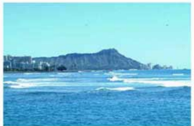
Diamond Head From Point Panic