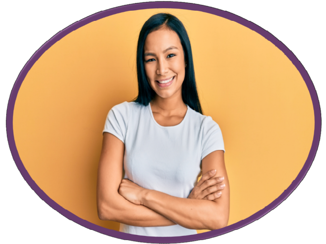
Meet the Producer