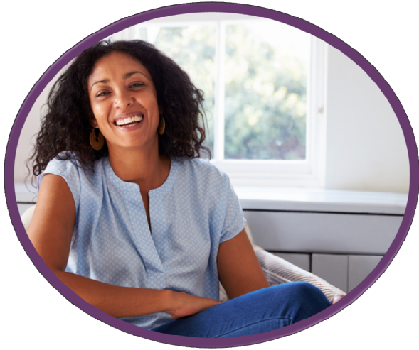
Meet the Facilitator