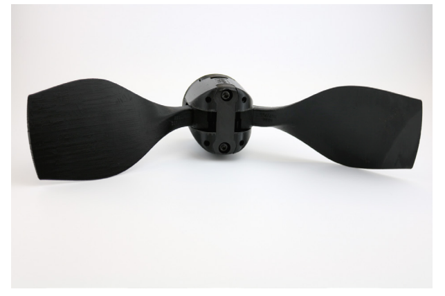
Using the Ultimaker, Sylatech saw an acceleration in the placement of tooling orders from its clients. They managed to earn back the investment in their Ultimaker machine within three months.