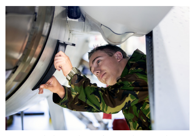
Custom tools designed to perform quality control

For example, when jet engines are transported, certain openings need to be covered with a special cap. These parts are expensive to purchase and slow to be delivered. However, using the Ultimaker it only takes about two hours to print the part.