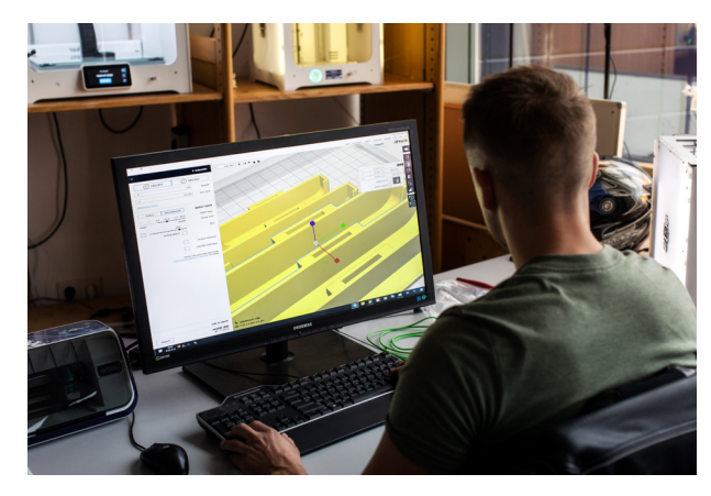
Preparing a print using Ultimaker Cura

His team will be able to share 3D models, create new designs, and support local personnel with printing. In this way, military maintenance engineers can manufacture the right tools, directly and locally.