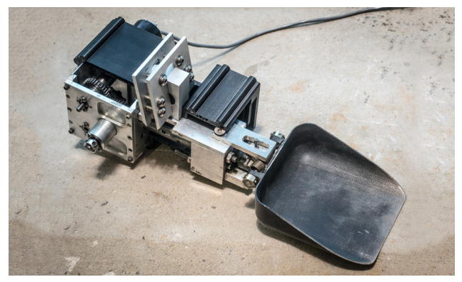
When designing equipment destined to travel hundreds of thousands of miles to perform to spec on the surface of another planet, it is worth exploring every possible scenario and iteration for your design here on Earth first.