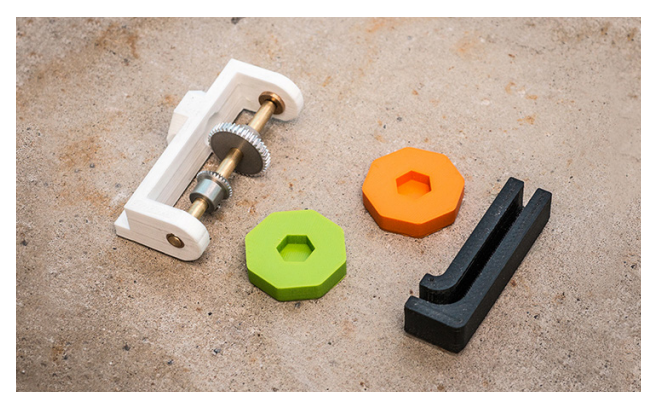
In the various phases of fabrication, it is often critical to inspect specific product features closely, or have the ability to view large parts on a smaller scale. 3D printing allows engineers to examine and adjust parts as necessary for more efficient production that reduces cost.

These days, most of the projects coming through their New York site have run parts on Ultimaker printers.