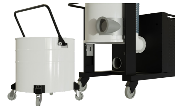
◀ Easy barrel release system