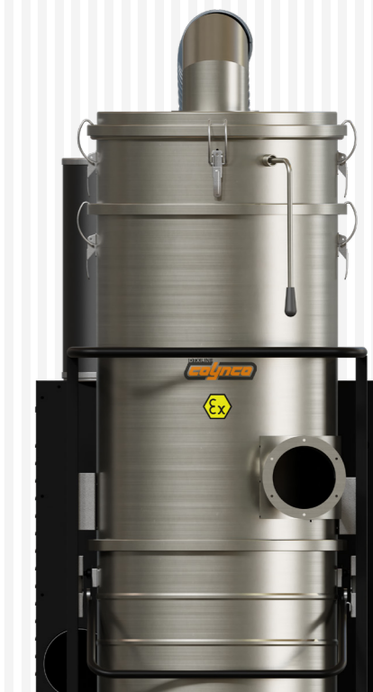
Available in ATEX version ▶