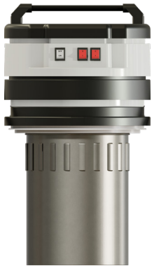
◀ Head with integrated semi-automatic filter cleaning system. Activated by push button.