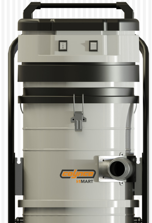
Tangential inlet ▶