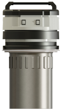
◀ Head with integrated semi-automatic filter cleaning system. Activated by push button.