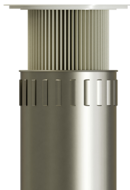
◀ Cartridge filters available with conductive M or HEPA filter media