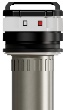
◀ Head with integrated semi-automatic filter cleaning system. Activated by push button.