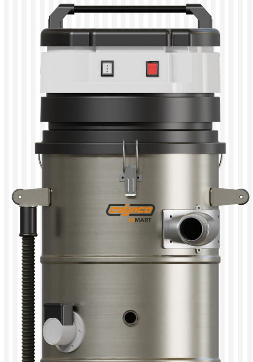
Tangential inlet ▶