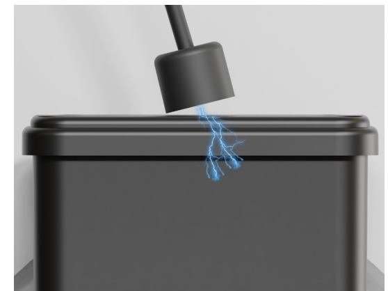
Electric float sensor with break-proof connection ▶