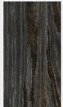
5901 WALNUT CARAMEL