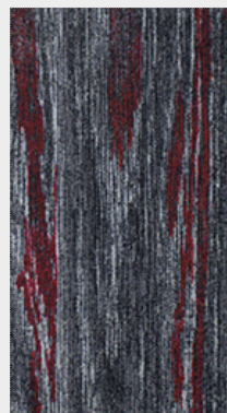
7906 EBONY GARNET