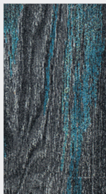
7908 EBONY MARINE