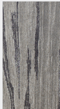
7207 BIRCH ASH