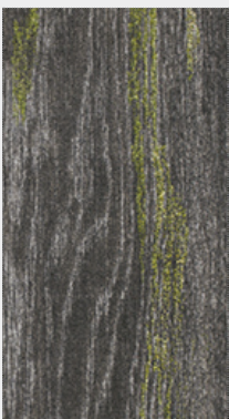
5909 WALNUT MEADOW