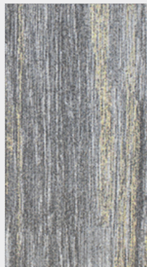
7405 IRONWOOD PEACH