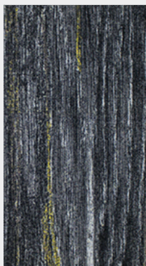
7903 EBONY BRONZEEN