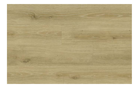
Alpine Oak Color - Code : 6110