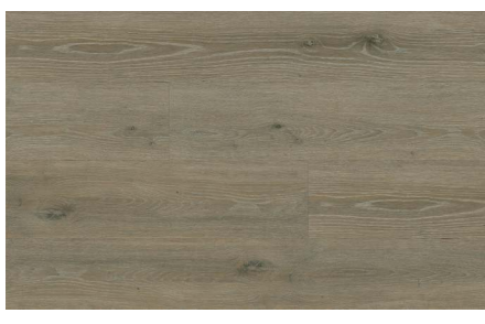
Swiss Oak Color - Code : 6111