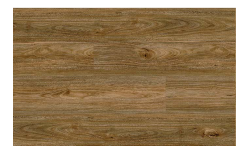
Spotted Gum Color - Code : 6114