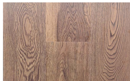
Le Chateau Color - Code : 8312