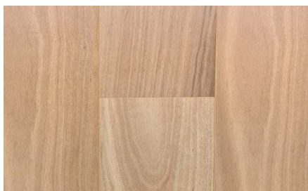
Blackbutt Color - Code : 8310