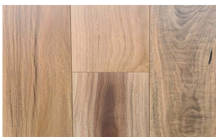
NSW Spotted Gum Color - Code : 8311