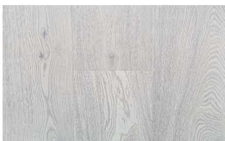
Moon Linght Color - Code : 8313