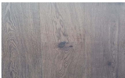
Chestnut Brown Color - Code : 8314