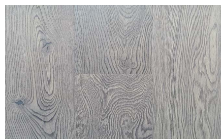
Smokey Grey Color - Code : 8315