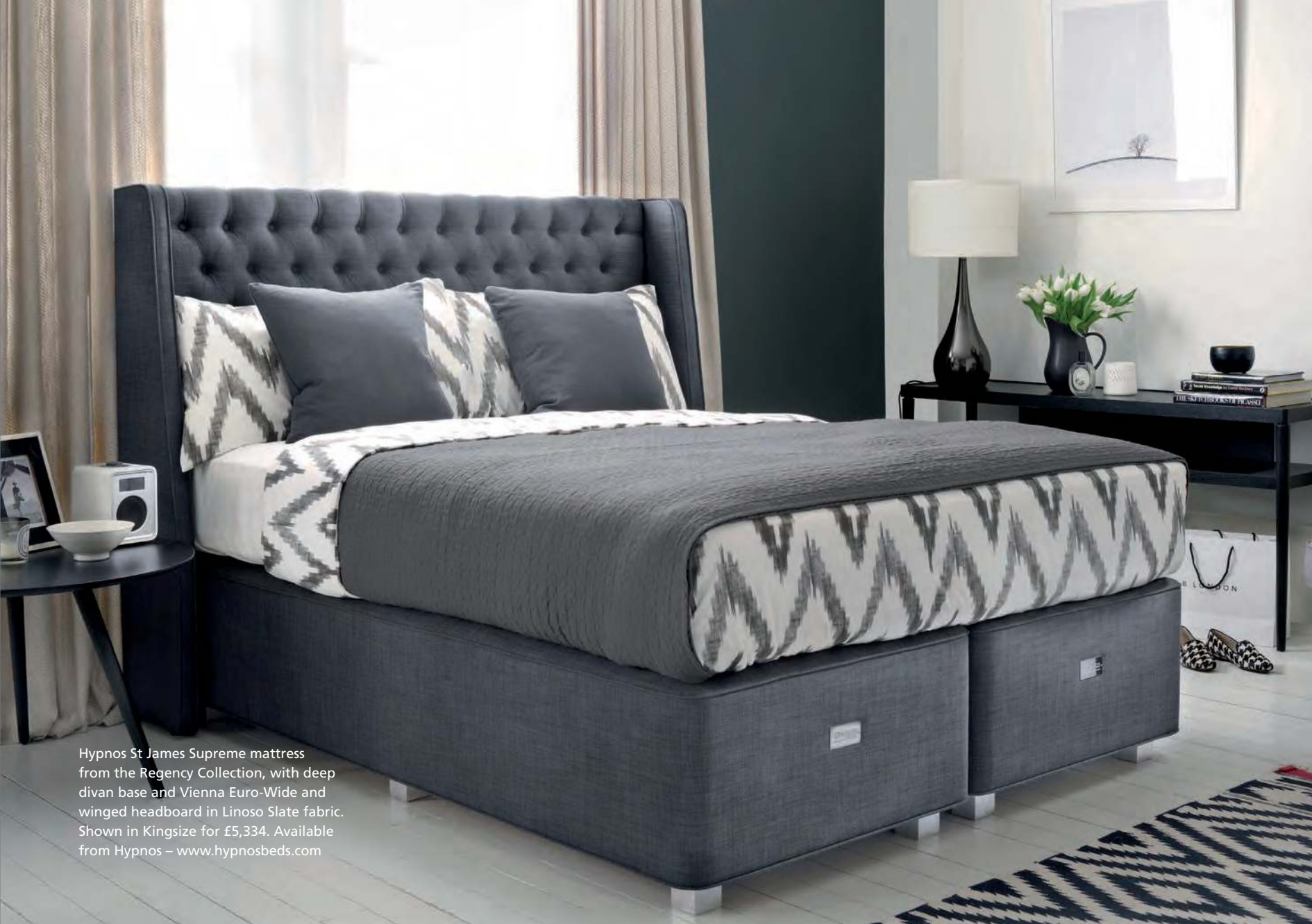
Hypnos St James Supreme mattress from the Regency Collection, with deep divan base and Vienna Euro-Wide and winged headboard in Linoso Slate fabric. Shown in Kingsize for £5,334. Available from Hypnos – www.hypnosbeds.com