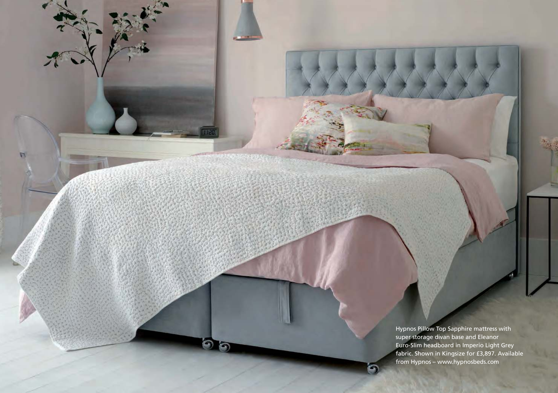
Hypnos Pillow Top Sapphire mattress with super storage divan base and Eleanor Euro-Slim headboard in Imperio Light Grey fabric. Shown in Kingsize for £3,897. Available from Hypnos – www.hypnosbeds.com