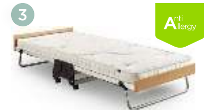
J-Bed Single with a Micro e-Pocket mattress