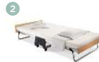
J-Bed Single with a Memory e-Fibre mattress