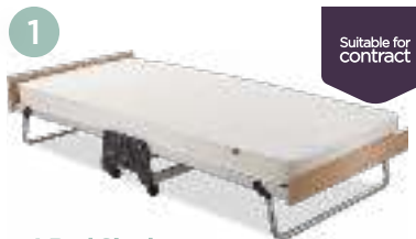
J-Bed Single with a Performance e-Fibre† mattress