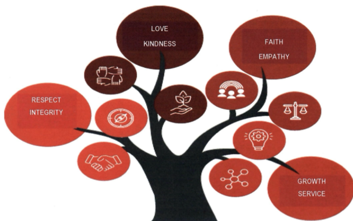
The FBCM Conversation Series

Please join us for interactive conversations focusing on building community at FBC Moorestown on Sunday, July 20 th from 11:15 am - 12:00 pm in Fellowship Hall. This will be a time of sharing our collective core values. As we engage in this process, we will not only deepen our connections with one another but also strengthen our collective ties to the community we serve. You'll even be introduced to the FBCM Community Bear. Curious? Sign-up sheets are located on the table at the Sanctuary Entrance and in Fellowship Hall.