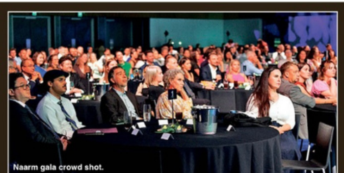
Naarm gala crowd shot.