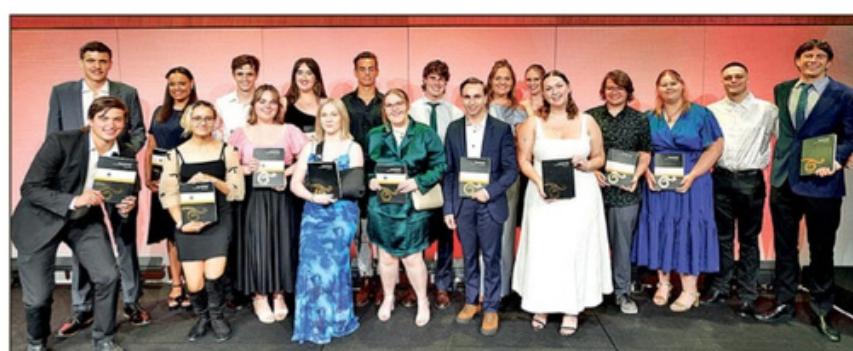
Gold Diary award winners at the Careertrackers gala awards in Naarm.