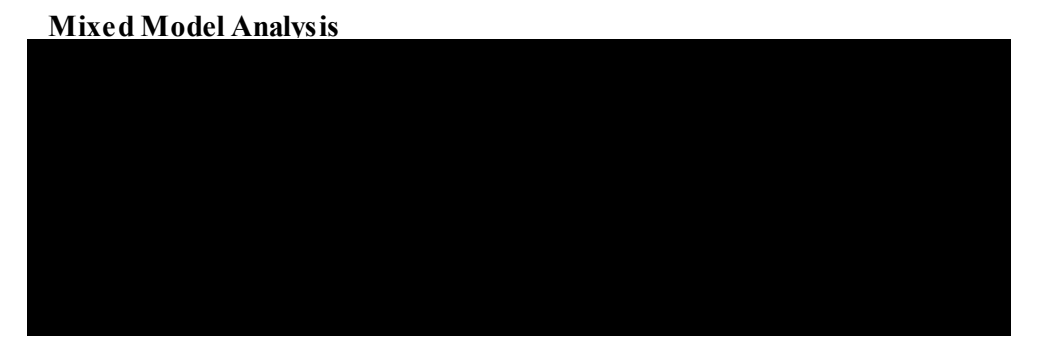
8.6. Safety and Tolerability Assessments

Examples of the SAS code that will be used are as follows: