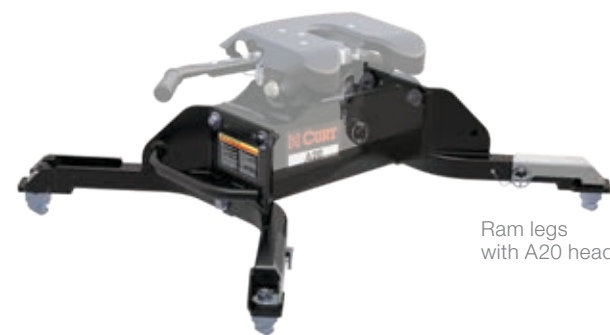
Ram legs with A20 head

Leg and roller options available for Chevrolet, Ford, GMC, Nissan and Ram (pictured)