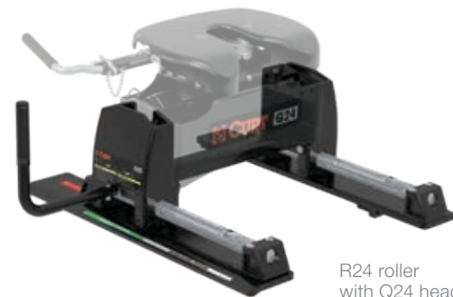
R24 roller with Q24 head