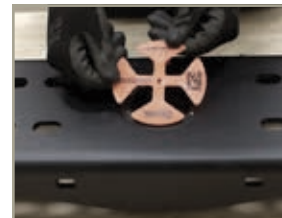
Step 1 - Place the Center Locator into the gooseneck hitch ball hole