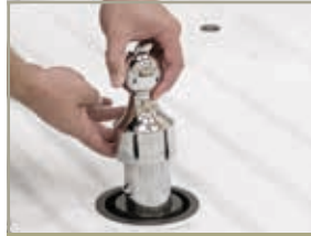
Step 2 - Drop in ball and return latch to lock in place