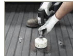
Step 4 - Use the pilot hole to drill down with no measuring required