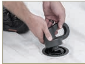
Step 3 - Drop in each anchor and twist 1/4-turn