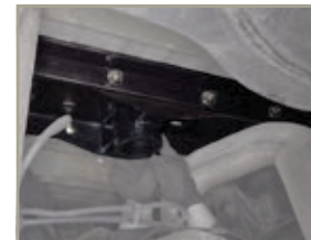
Step 2 - Bolt the installation brackets and hitch to the vehicle frame