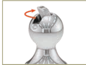
Step 1 - Lift and twist latch to release the retention balls