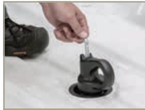
Step 4 - Secure with the provided linchpins