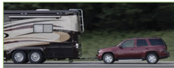
Connects a towed vehicle to an RV using a standard 4-way flat trailer plug