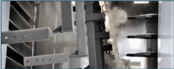
Our hitches are co-cured with a durable powder coat for industry-leading rust, chip and UV protection