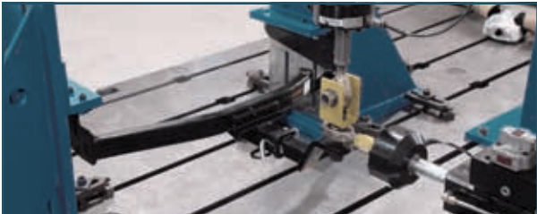
We test our hitches in-house at our Detroit facility according to SAE J684 specifications