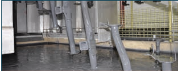
For rust resistance inside and out, our hitches are immersed in a liquid Bonderite®