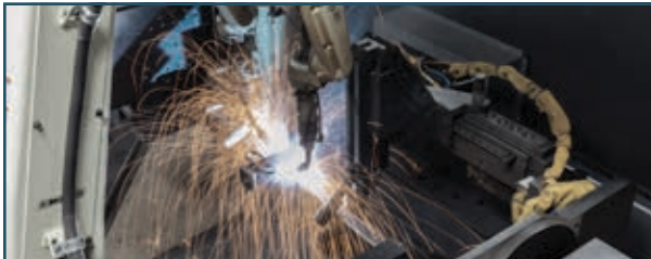
All CURT custom-fit receiver hitches are engineered, fabricated and welded in the USA