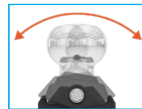
Dampens jerking and jarring from uneven roads for smoother towing