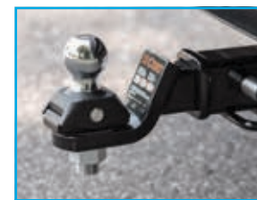
Retrofits most existing ball mounts to improve current towing experience