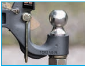
Cupped hook tightly holds lunette ring fore and aft to reduce chucking and noise