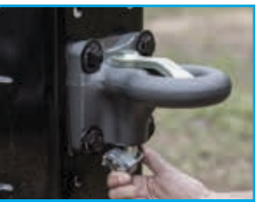
Drop-in pin accepts lock to deter theft (turns 90 degrees while coupled)