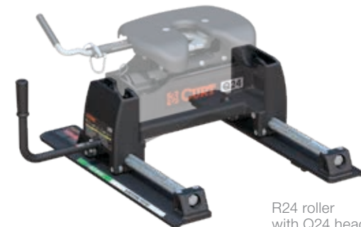
R24 roller with Q24 head