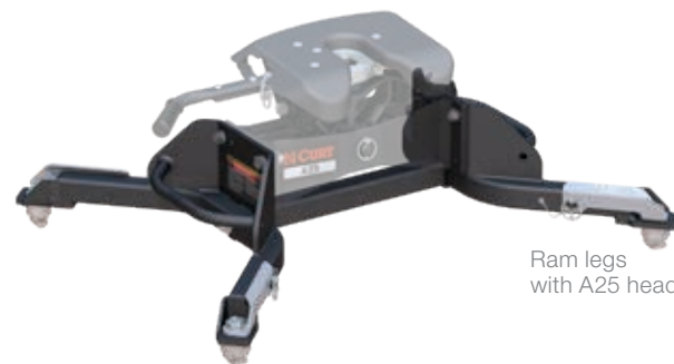
Ram legs with A25 head

Leg and roller options available for Chevrolet, Ford, GMC, Nissan and Ram (pictured)