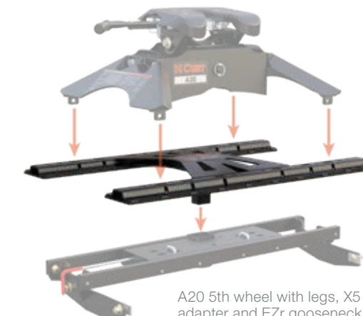
A20 5th wheel with legs, X5 adapter and EZr gooseneck