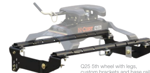
Q25 5th wheel with legs, custom brackets and base rails