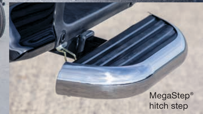
MegaStep® hitch step