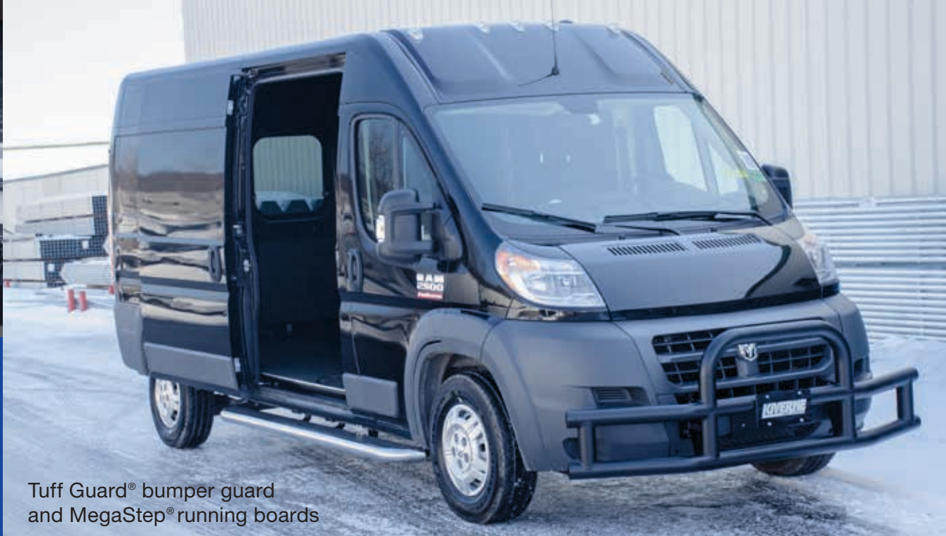
Tuff Guard® bumper guard and MegaStep® running boards