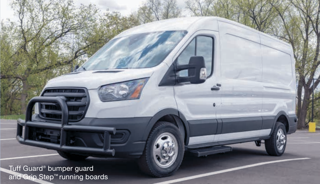
Tuff Guard® bumper guard and Grip Step™ running boards