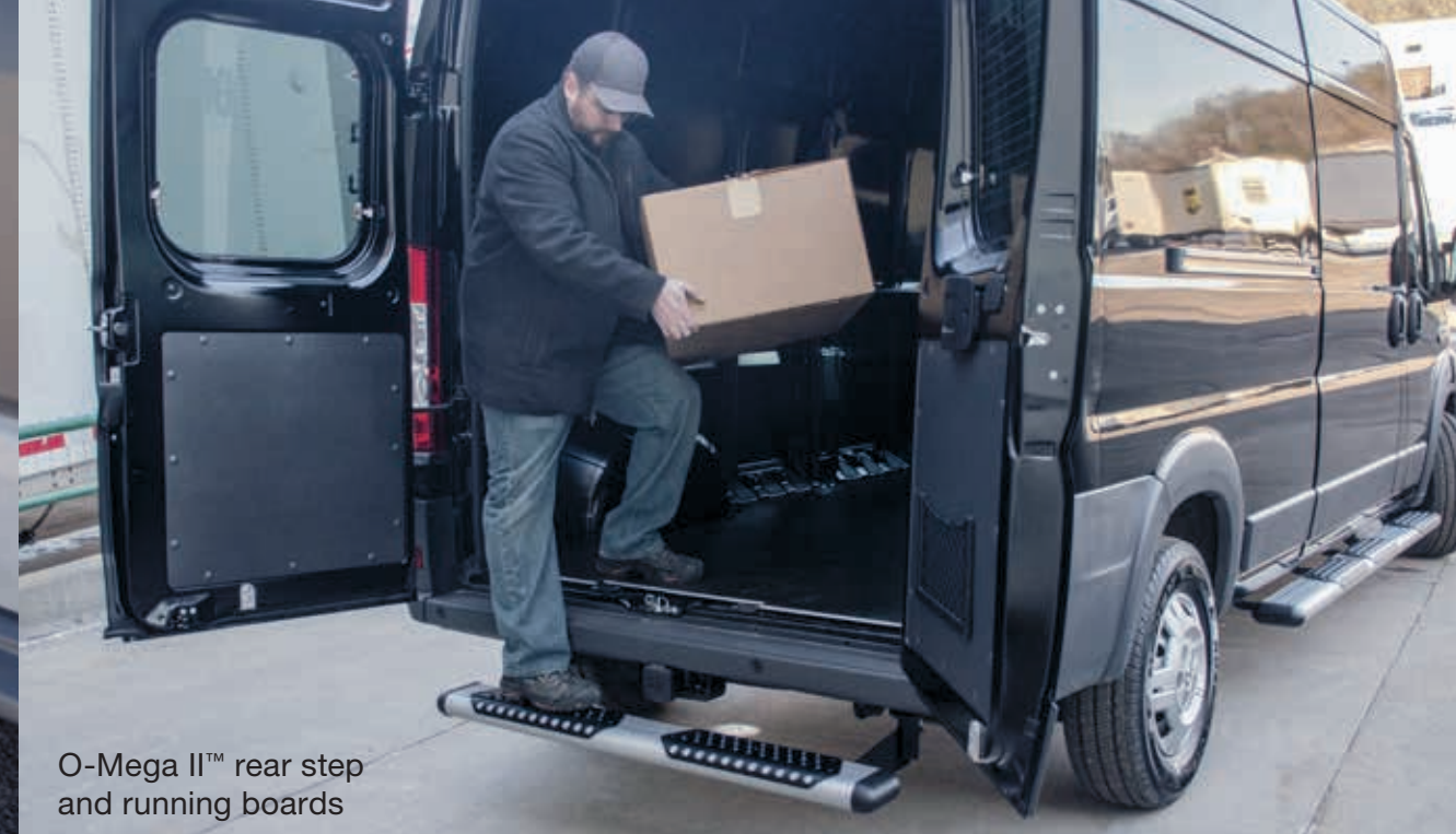
O-Mega II™ rear step and running boards