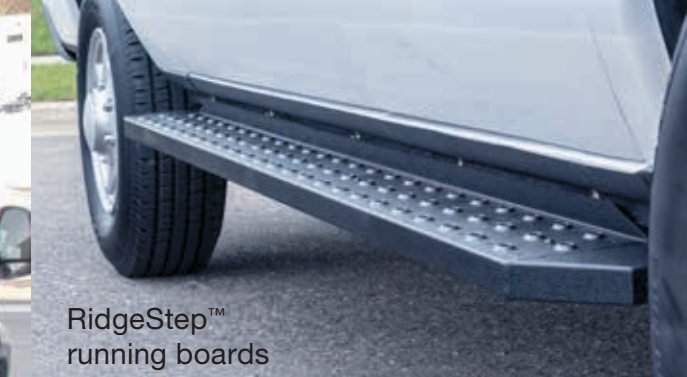
RidgeStep™ running boards