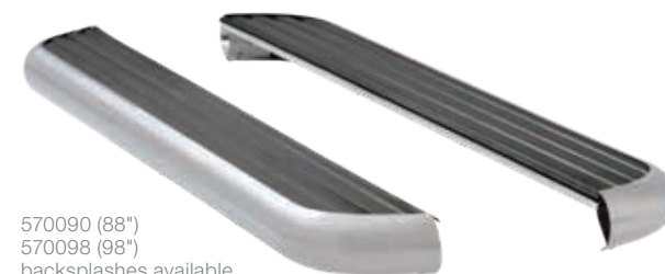
570090 (88") 570098 (98") backsplashes available