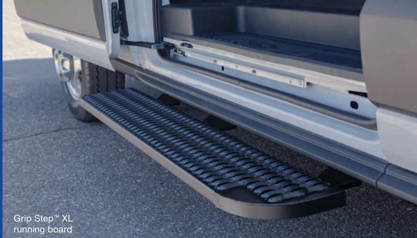
Grip Step™ XL running board