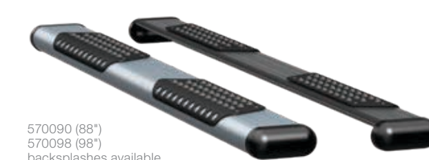
570090 (88") 570098 (98") backsplashes available