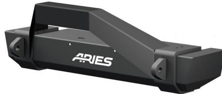
96-06 Jeep TJ