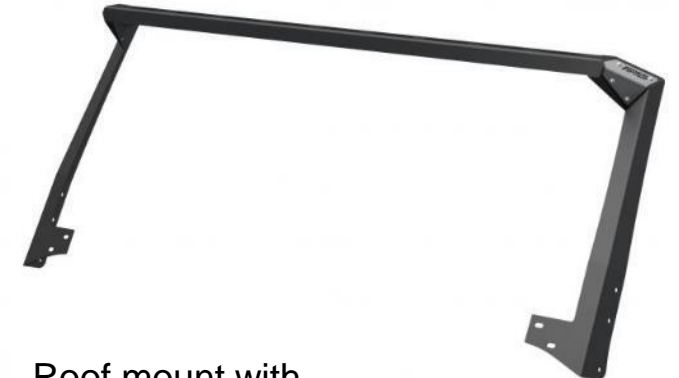
Roof mount with crossbar for work lights