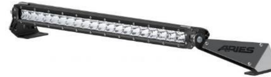
Hood mount with 20" light bar