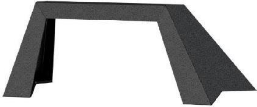
Stinger-style brush guard