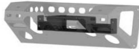
Winch reinforcement (aluminum bumpers only)