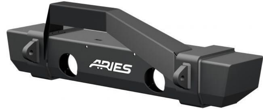
07-18 Jeep JK