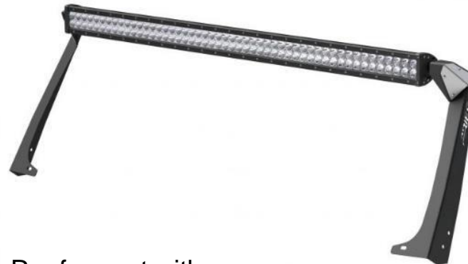
Roof mount with 50" light bar