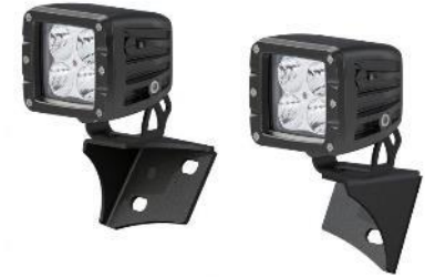
Windshield mounts with 2" lights