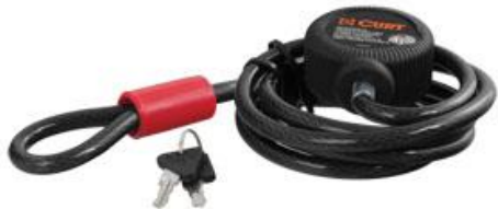
Multi-Use Cable Lock