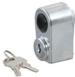
Spare Tire Lock