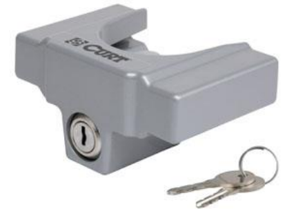
Over-coupler style also available