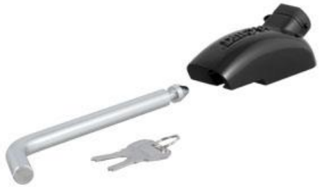
5th Wheel Rail Lock