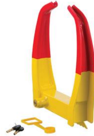
Wheel Chock Lock