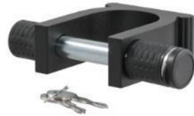
5th Wheel Kingpin Lock