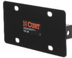
License plate holder