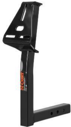
Spare tire mount