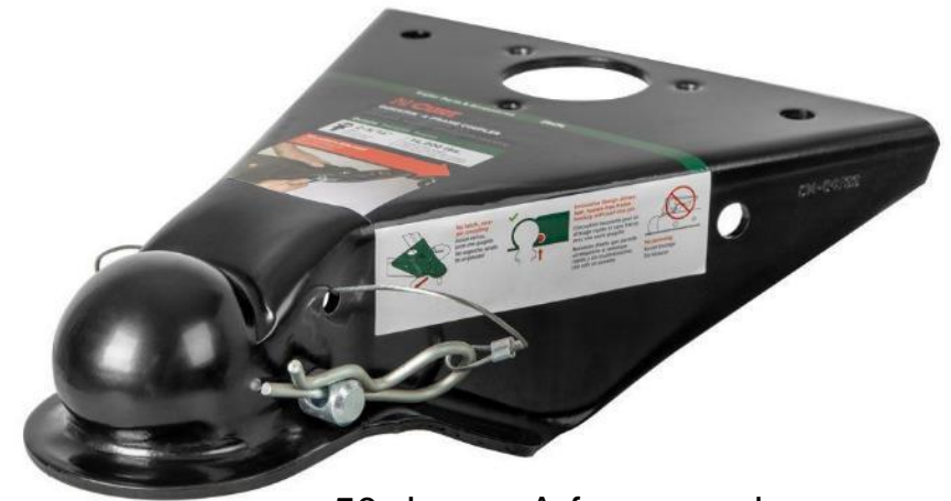
50-degree A-frame angle to fit most A-frame trailers