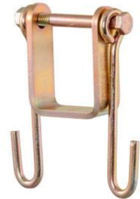
Safety chain hanger #45806 available for 2" shanks