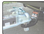
25034 securing a coupler latch