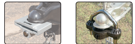
Two different designs fit multiple coupler sizes to secure unattended trailers