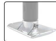
28278 securing a jack foot