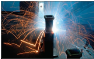
Precision robotic welding for superior strength and fit