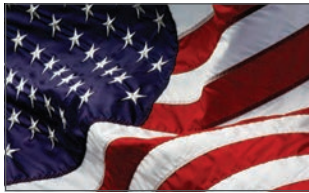
Proud to manufacture all of our custom hitches in the USA