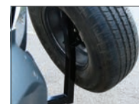
24" height accepts multiple tire sizes (31006)