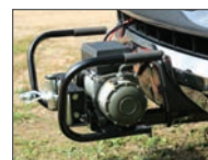
Allows a winch to be easily attached to a receiver (31009)