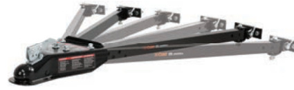
Tow bars adjust to fit different vehicles