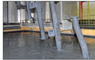
Liquid Bonderite® applied inside and out for max rust resistance