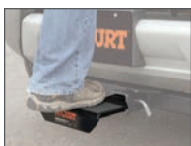
Step pad provides easy under the hood access (31001)