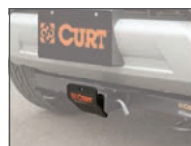
Provides protection for the front end and hitch (31007)