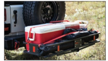
Secures cargo better than bungee cords or rope