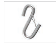
Safety latch S-hook