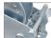
23424 pinion gear