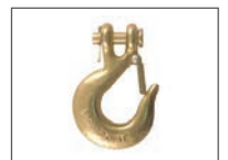
Safety latch clevis hooks