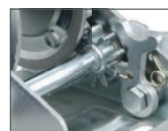
23423 pinion gear