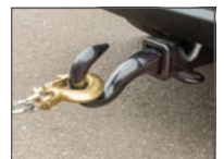
80315 with 45500