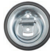
83710 in 83720