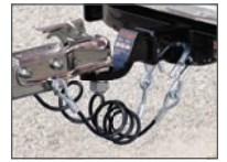
Safety cables in use