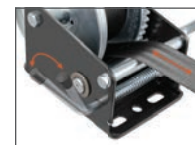
23438 locking lever