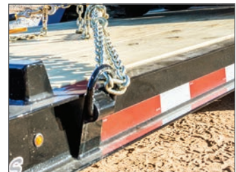
Shown on trailer