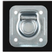
83600 & 83607