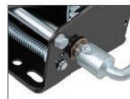
23427 crank handle