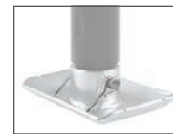
#28278 securing a jack foot