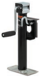
28302 bracket mount