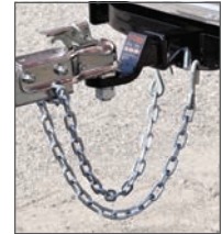
Safety chains in use