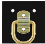
83740 & 83607