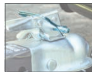
#25034 securing a coupler latch